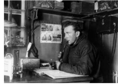
Alfred Wegener, Greenland, 1930