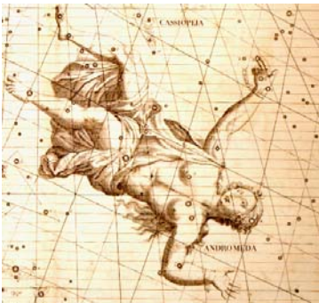
Plate from Historia Coelestis Britannica

decided that Flamsteed's calculations were erroneous, and substituted 3 Cassiopeiae for the nearby star AR Cassiopeiae which was in the same location as her recalculated values for the coordinates for 3 Cassiopeiae. Francis Baily, picking up where Caroline Herschel left off, was not satisfied with her resolution of the problem with 3 Cassiopeiae. Because the actual observational data for reducing the coordinates for 3 Cassiopeiae were not written down, Baily excluded the star from the British Association catalogue which was published in 1845.