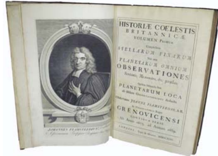
Flamsteed's Historia Coelestis Britannica

Herschel compiled an Index to Flamsteed's observations. She noted that Flamsteed had twice observed a star that he designated as 3 Cassiopeiae. Since no star was located at the coordinates he had calculated, Herschel