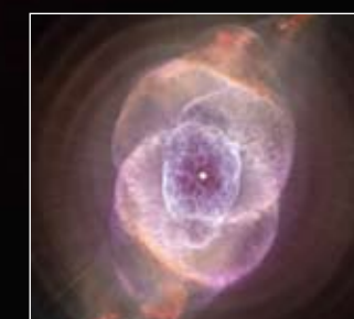
OPTICAL DATA FROM NASA'S HUBBLE