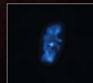
X-RAYS FROM NASA'S CHANDRA